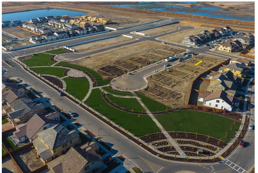
Summer House Park