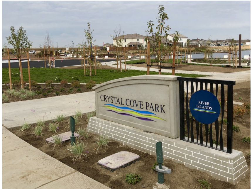
Crystal Cove Park

Finally, over in the future Town Center area, close to Bradshaw's Crossing Bridge, River Islands Development is planning and planting seven regulation soccer fields for a future soccer academy. It's an exciting concept, and more details will be posted at the beginning of the year.