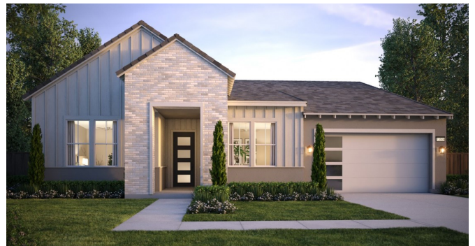
Avalon Plan 1—California Modern Farmhouse