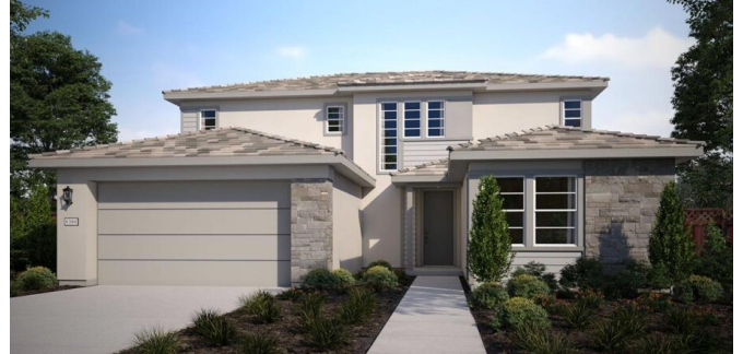
Waypoint Plan 2—The Lakeside Collection

Two all-new neighborhoods will start their Preview Showings in October, with Waypointe by The New Home Company and Avalon by Trumark Homes. The New Home Company has had sales people at a trailer location for information, and now has pricing and a list of homes available for sale. Avalon by Trumark Homes will welcome a new homebuilding company into our community with some of the largest homes available at River Islands, being built on large lots. Avalon is being built in a parkside setting, near to the now closing-out Breakwater neighborhood.